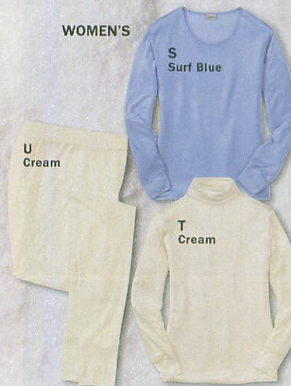
S Surf Blue