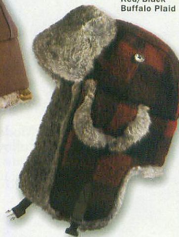
O Red/Black Buffalo Plaid