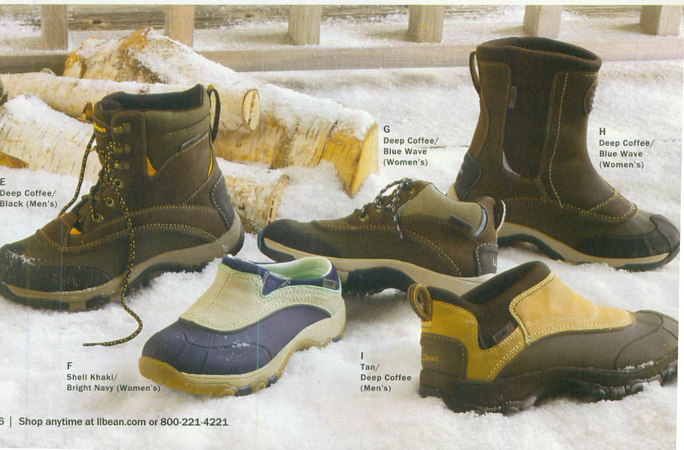
E Deep Coffee/ Black (Men's)