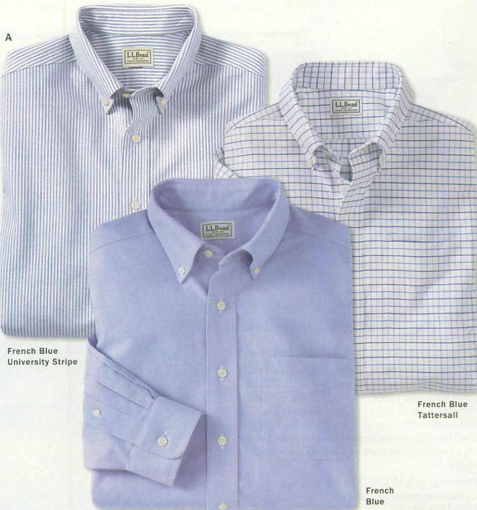
French Blue University Stripe

llbean.com customer, Baltimore, MD. Read more customer reviews online.