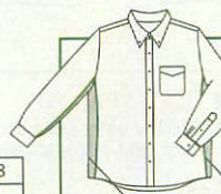
TRADITIONAL FIT TRIM FIT

new TRIM FIT A tailored fit that's cut closer to the body but isn't tight or constricting.